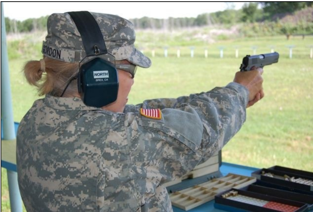
A soldier takes aim at the annual Armed Forces Day celebration May 18

The Austin Rifle Club, Inc. is an organization of about 1,200 Central Texans who enjoy shooting sports, competition, and are devoted to safety and education. The Club traces its roots to a club chartered in 1894. The Club is a private, not-for-profit organization associated with the National Rifle Association, the Texas State Rifle Association, and the Civilian Marksmanship Program. The Club has an active NRA Junior Division. Range facilities are on Littig Road, between Manor and Elgin. The range is situated on a Club-owned 28 acre tract developed for several different shooting disciplines. The Austin Rifle Club has seven shooting ranges, from seven to 300 yards.